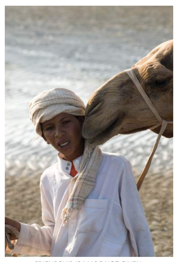
FRIENDSHIP IS MADE NOT GIVEN