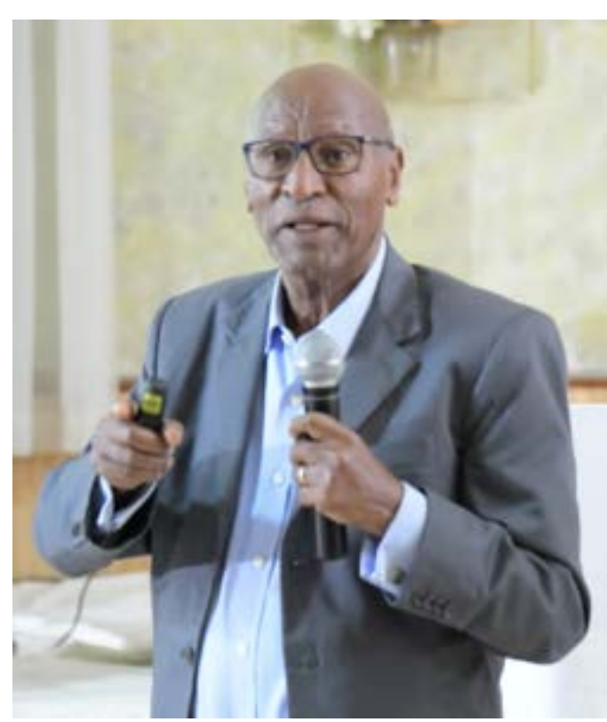
H.E. Arefaine Berhe, Minister of Agriculture