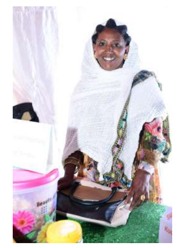
EWAA, Top-bar Hive Honey Production