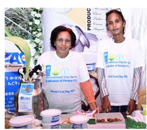
EWAA, Zac Milk And Milk Processing Plant