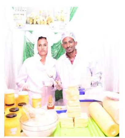
SMAP, Dairy products