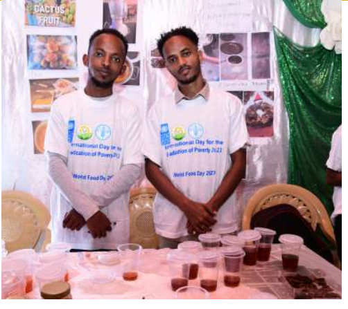
HAC, Food Technology Department