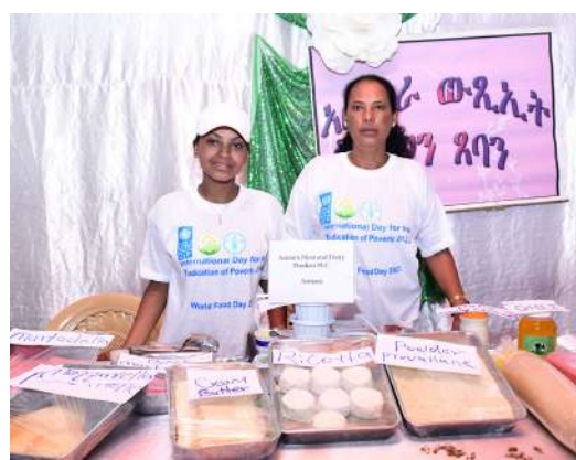
Asmara, Meat and Milk Processing