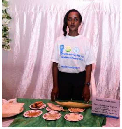
Ministry of Education, Team of Nutrition Experts