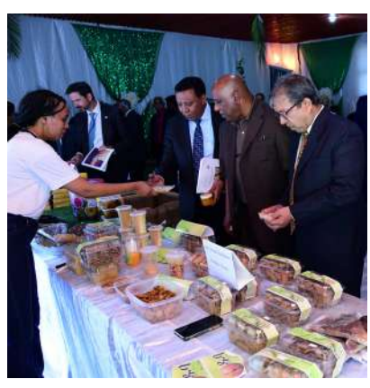
EWAA, Pumpkin Value Addition