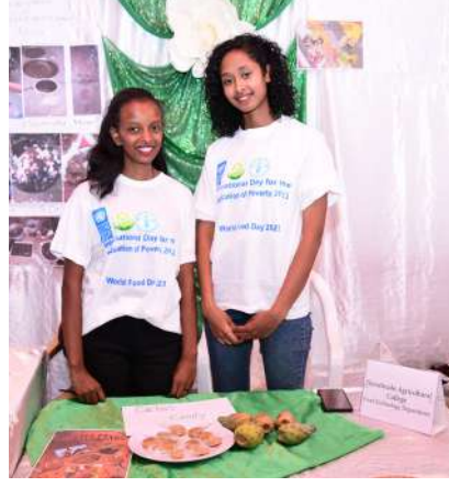
HAC, Food Technology Department