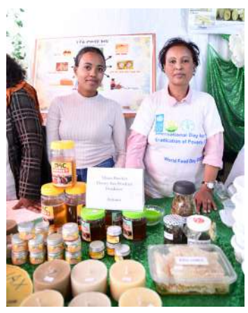
EWAA, Honey Products