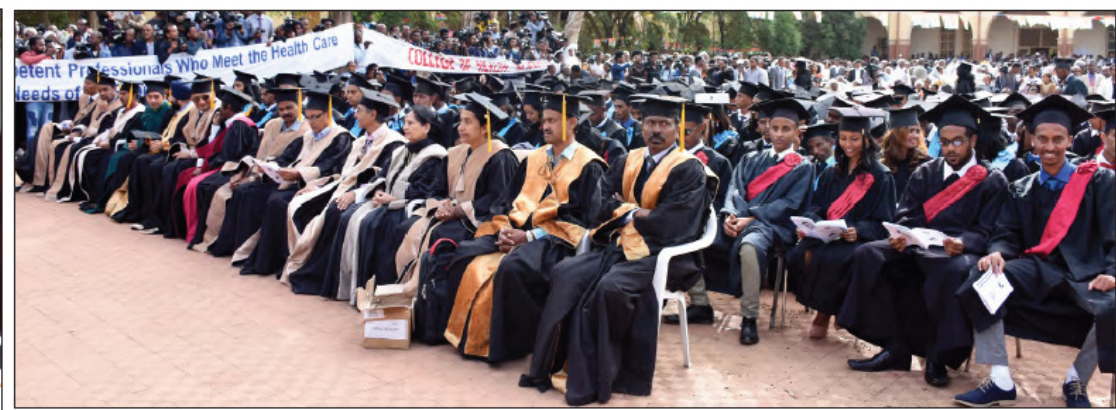
Halhale College of Business and Economics

Location: Southern Region Latest Graduates: 315 (42% of whom are female)