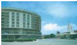
Fiat Tagliero Service Station – Futurist style. The construction of the Nakfa House (small picture above) in 1995 caused a wake up call for the concerned public to protect the cultural heritage of Asmara. Current address: Mereb Street/ Sematat Avenue Architect: Guiseppe Pettazzi Date: 1938

In Asmara, the Casa del Fascio building is the clearest example of this transition in Italian architecture. The frontage was erected in 1940 as an amendment to the rather modest headquarters of the fascist party lying behind it, which was built in 1928 – a strategy, which testifies to a politically demonstrative motivation rather than to practical necessity.