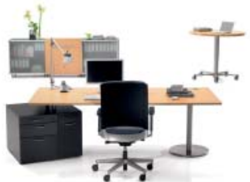
EXHIBIT SPONSORED BY VS VS International P.O. Box 1420 D-97941 Tauberbischofsheim Germany www.vs-furniture.com