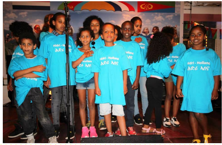
Vol 2. Issue 38, 05 August 2015