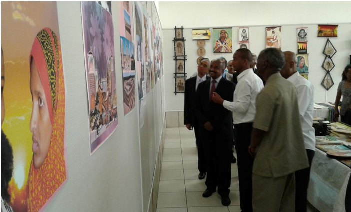
19<sup>th</sup> Eritrean Festival in Germany Giessen, 3-5 July 2015