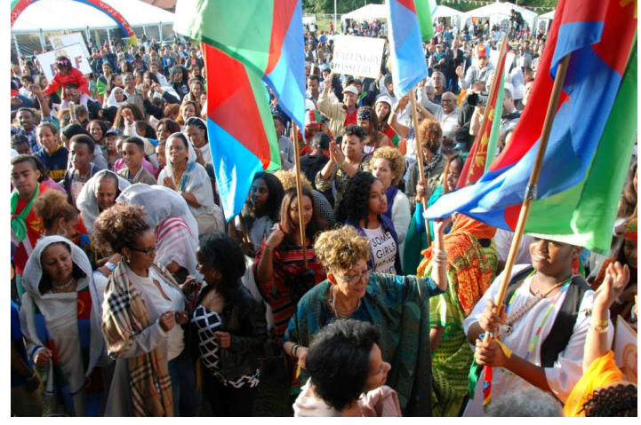
15<sup>th</sup> Festival Eritrea in Toronto 1-3 August 2015