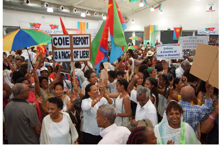
14<sup>th</sup> Eritrean Festival in Holland Rijswijk, 10-12 July 2015