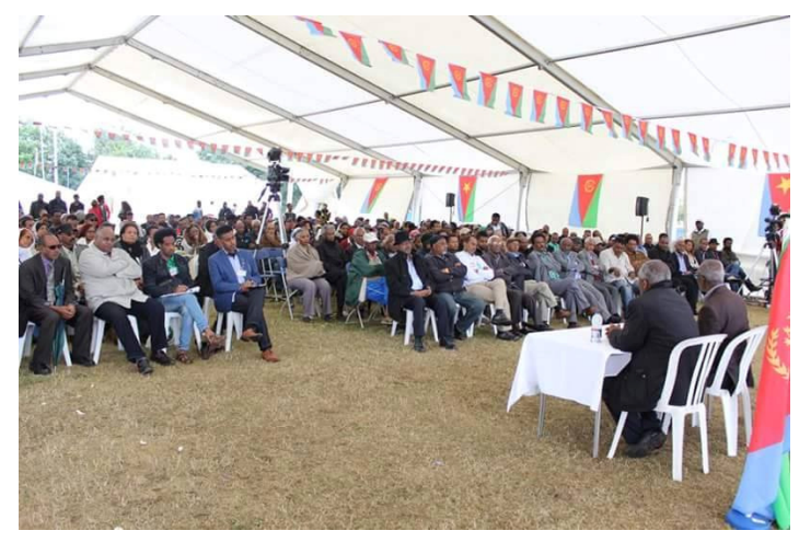
17<sup>th</sup> Eritrean Festival in Scandinavian Countries Stockholm, 30 July- 2 August 2015