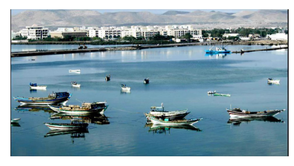
4:14 PM · 22 Feb 16