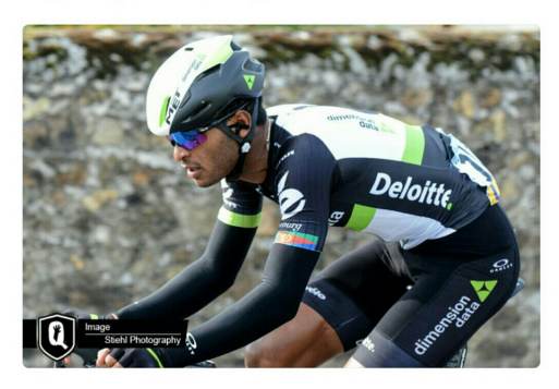
9:17 PM · 11 Mar 17