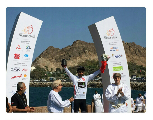
1:33 PM · 19 Feb 17

.@MeraKudus wins the white jersey #T002017