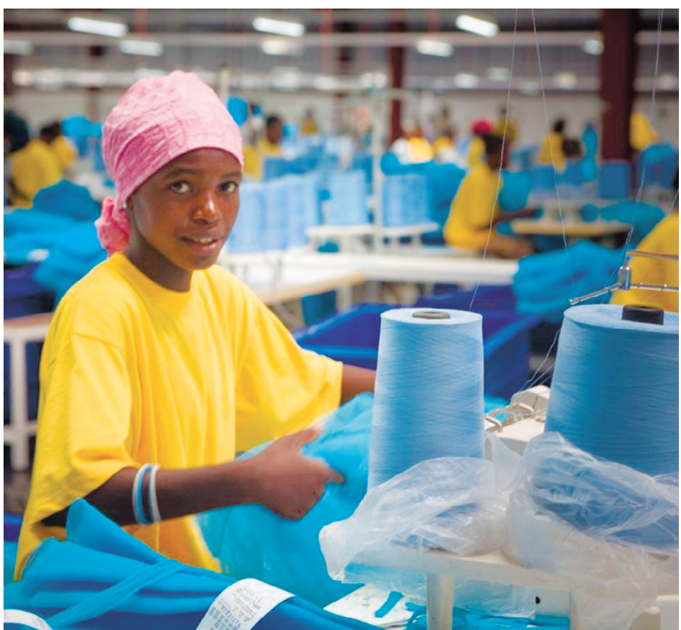
Top, residents prepare to install a Lixil SaTo, short for safe toilet, in Uganda in March 2016. Above, a woman works at a factory producing Sumitomo Chemical's Olyset.

Because the support you offer from the empassies is very m fitant. me private sector faces many problems in their daily business. For example, they may have difficulty clearing shipments at customs, because shipments arrive at a port and it takes time, or they send their people but it may take time to get a working visa. To solve such problems, the private sector's insight, we will make one of the things we did in Kenya was to organize a meeting with deputy ministhings happen with our government. We ter-level government staff, the Japanese embassy and business representatives in Nairobi every month at which each company would report their problems. So both small and important issues were raised and the deputy minister in any comments from the ambassadors? charge would appoint someone to solve them.