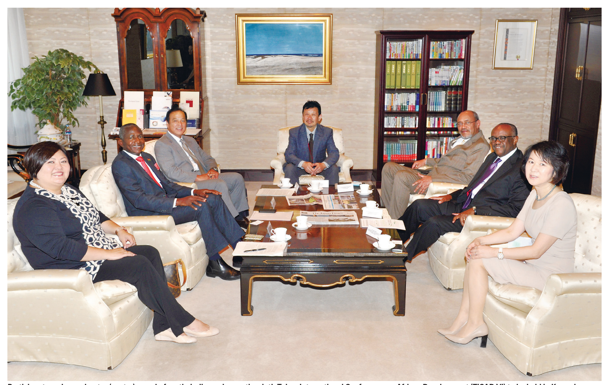
Participants and a moderator (center) pose before their discussion on the sixth Tokyo International Conference on African Development (TICAD VI) to be held in Kenya in August at The Japan Times' offices in Tokyo on June 3.

ing was becoming a multilateral platform bringing key agents on board.