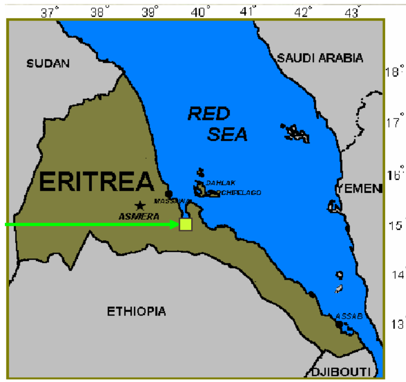
Figure 1: Alid geothermal project, location map.