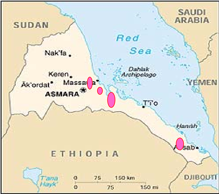
Figure 4: Overview of geothermal areas in Eritrea.